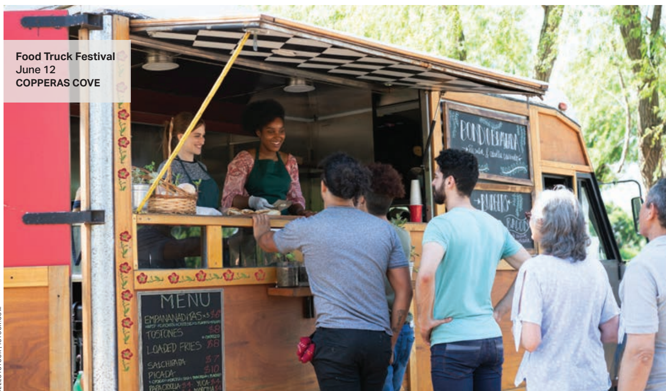
Food Truck Festival June 12 COPPERAS COVE

Chamber Market Days ; June 11, July 9; 8 a.m.–1 p.m.; Cotton Belt Depot; 2307 S. Highway 36. Browse vendors offerings including fresh fruits and vegetables, metal decor, honey, salsa, jellies, baked goods, plants, homemade crafts, and furniture.